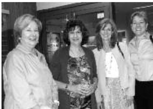
Board members socialize.