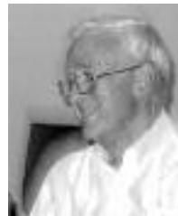
Attendees enjoyed the presentation.