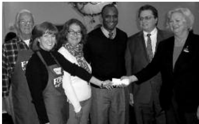
Check presentation on behalf of the Friends of the Hockessin Library.