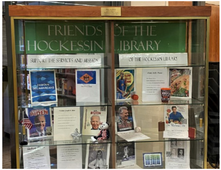
Famous Delawareans exhibit now on display in the Hockessin Library lobby.

Famous Delawareans will be on display through the end of November 2022.